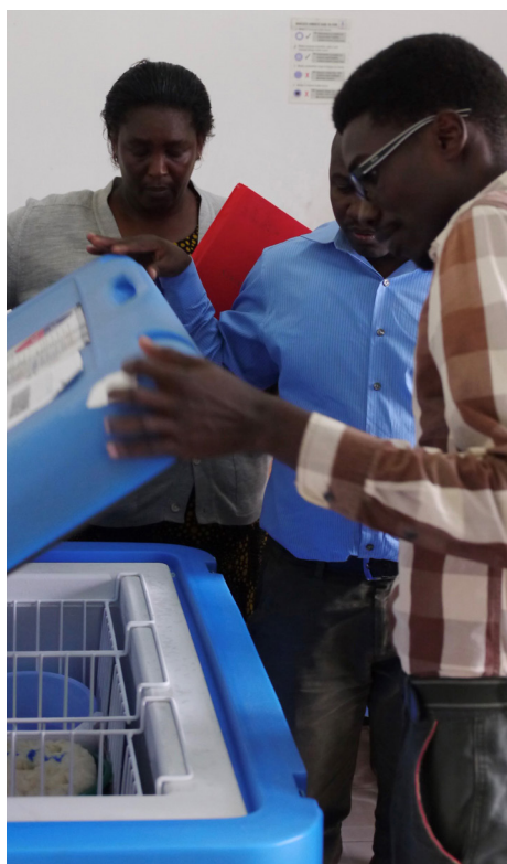
The district immunization vaccine officer at a health facility in Morogoro district, Tanzania.