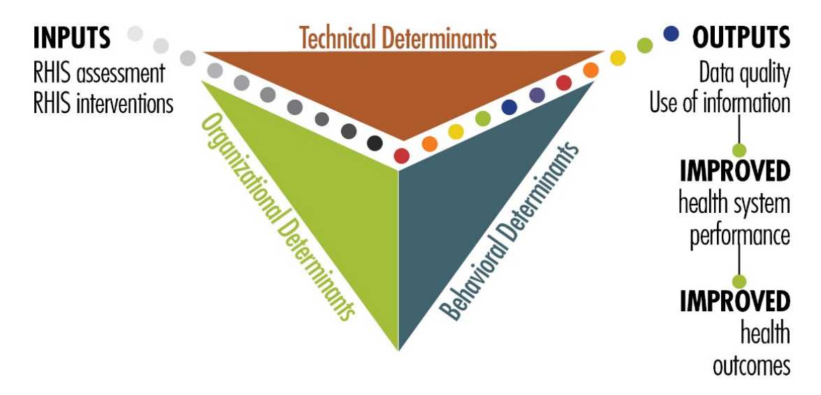
Figure 1. PRISM Framework