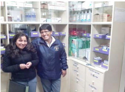
USAID | DELIVER PROJECT February 2015

Technical staff in the La Libertad region of Peru, collect warehousing and transportation costs for the public health supply chain.