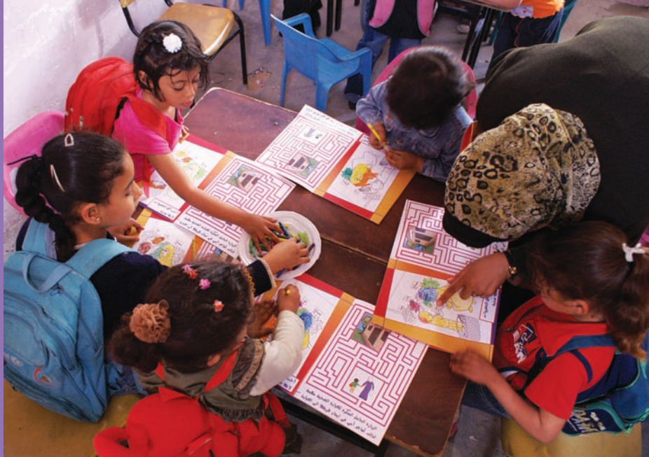
A PCHRD community health worker uses the Hanan's Children's Activity Book to teach children about healthy nutrition.