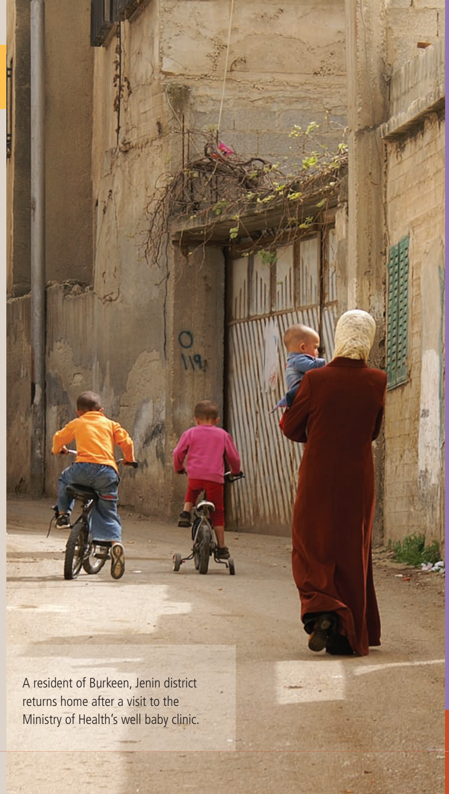
A resident of Burkeen, Jenin district returns home after a visit to the Ministry of Health’s well baby clinic.