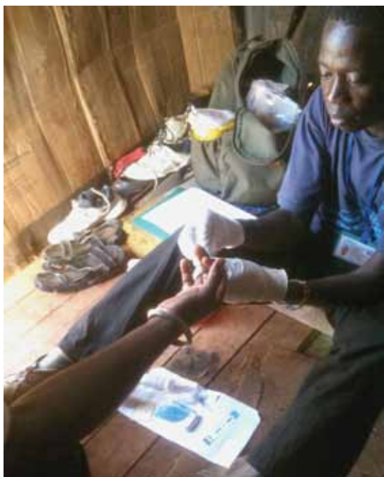
Counselors must be creative when testing clients as they enter humble homes, as pictured here in Kibera, which may not have a table or chair on which to perform the HIV test.

children, other family members, neighbors, and friends—requires a different skill set on the part of the HTC provider. A competent HTC provider would be trained in all of these scenarios.