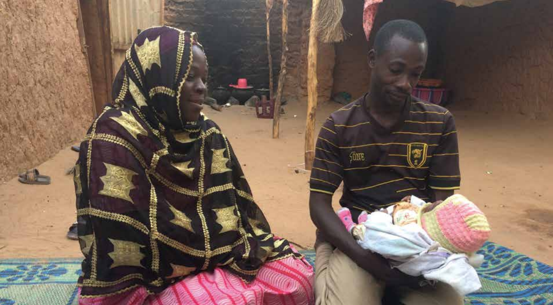
A man helps his wife with child care in the village of Dan Gado.

Zinder, engaging three new partners. 2 As a result, activities were scaled up in 2016 from 20 villages to 115—61 villages in Zinder and 54 in Maradi—reaching 460 groups (9,200 beneficiaries) with a video once a month. During this phase, SPRING worked with Digital Green and local partners to establish four video production hubs—two in each region of Niger—and to establish two technical advisory groups that would prioritize video content.