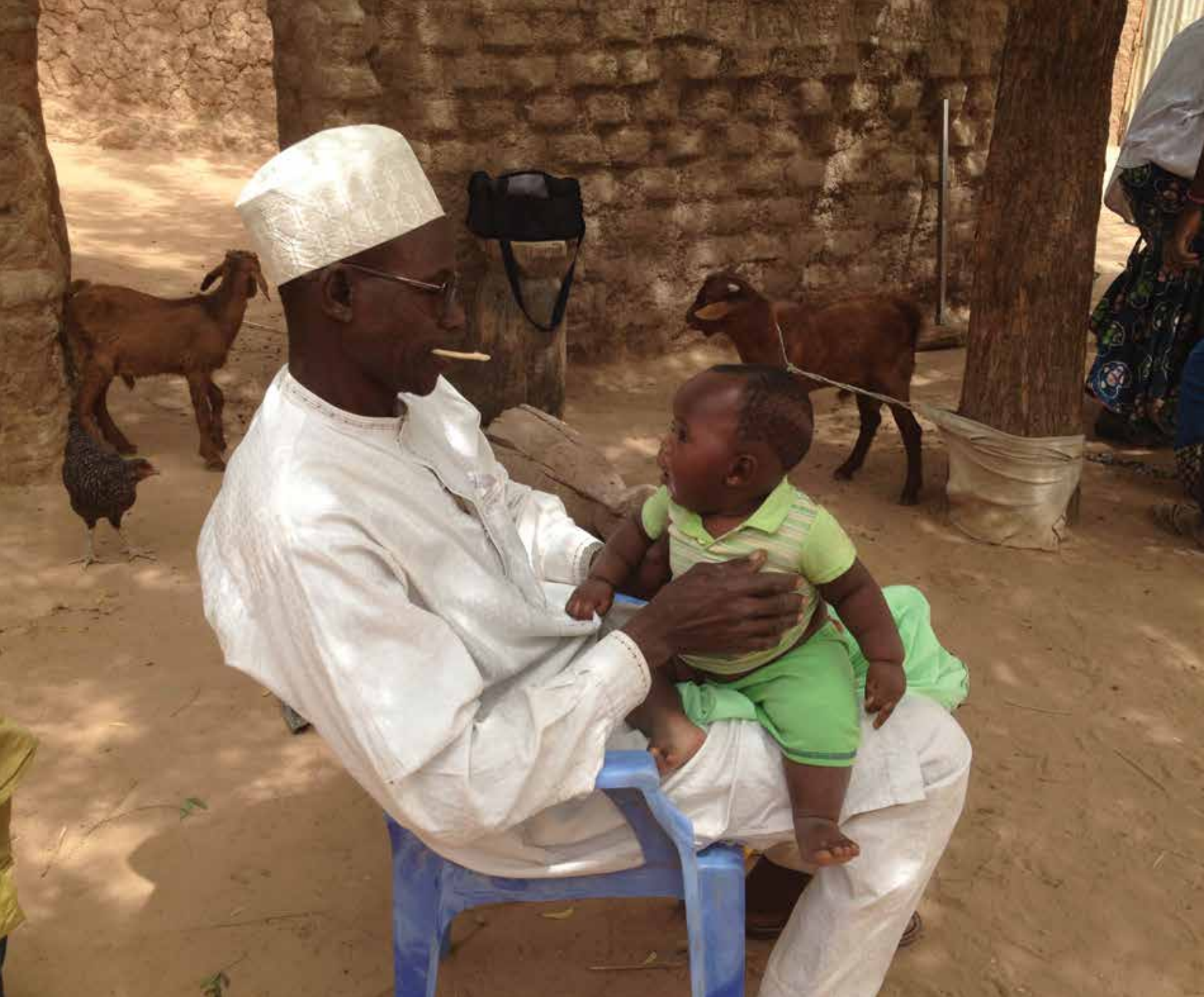
A father and child play in the village of Dan Turke, where the SPRING team was filming a video on how men can support handwashing in the household.