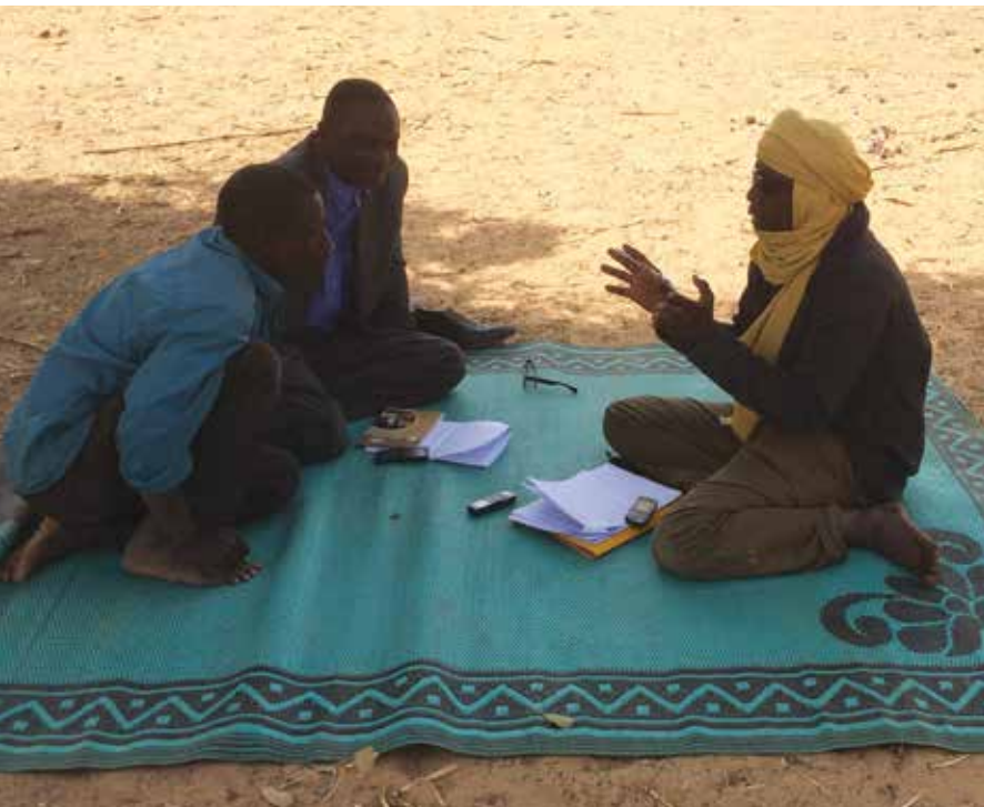
Members of the study team interview a father in Naki Karfi.