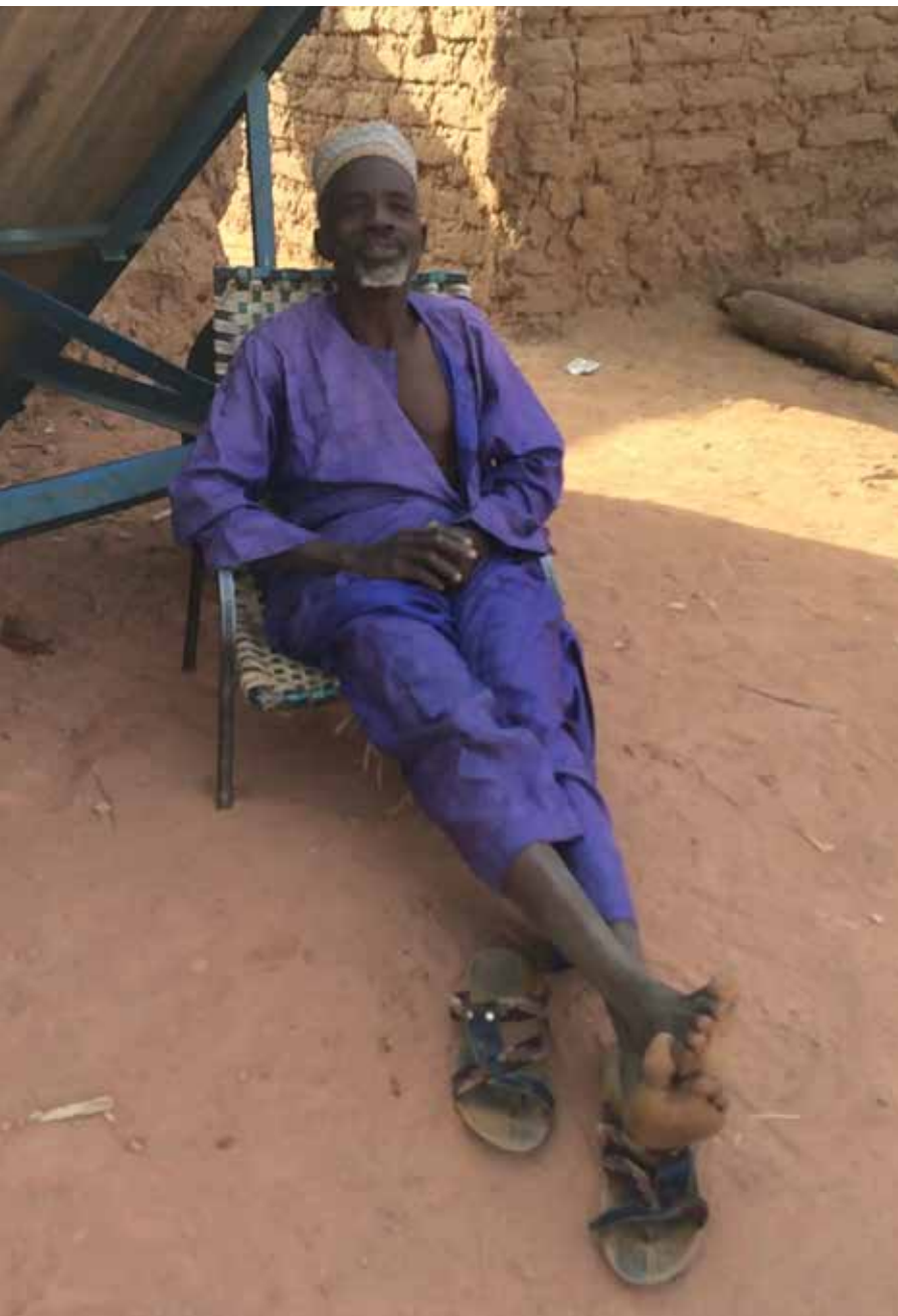
A father relaxes in Maradi, Niger, where community videos are helping couples increase their communication about household nutrition and hygiene.