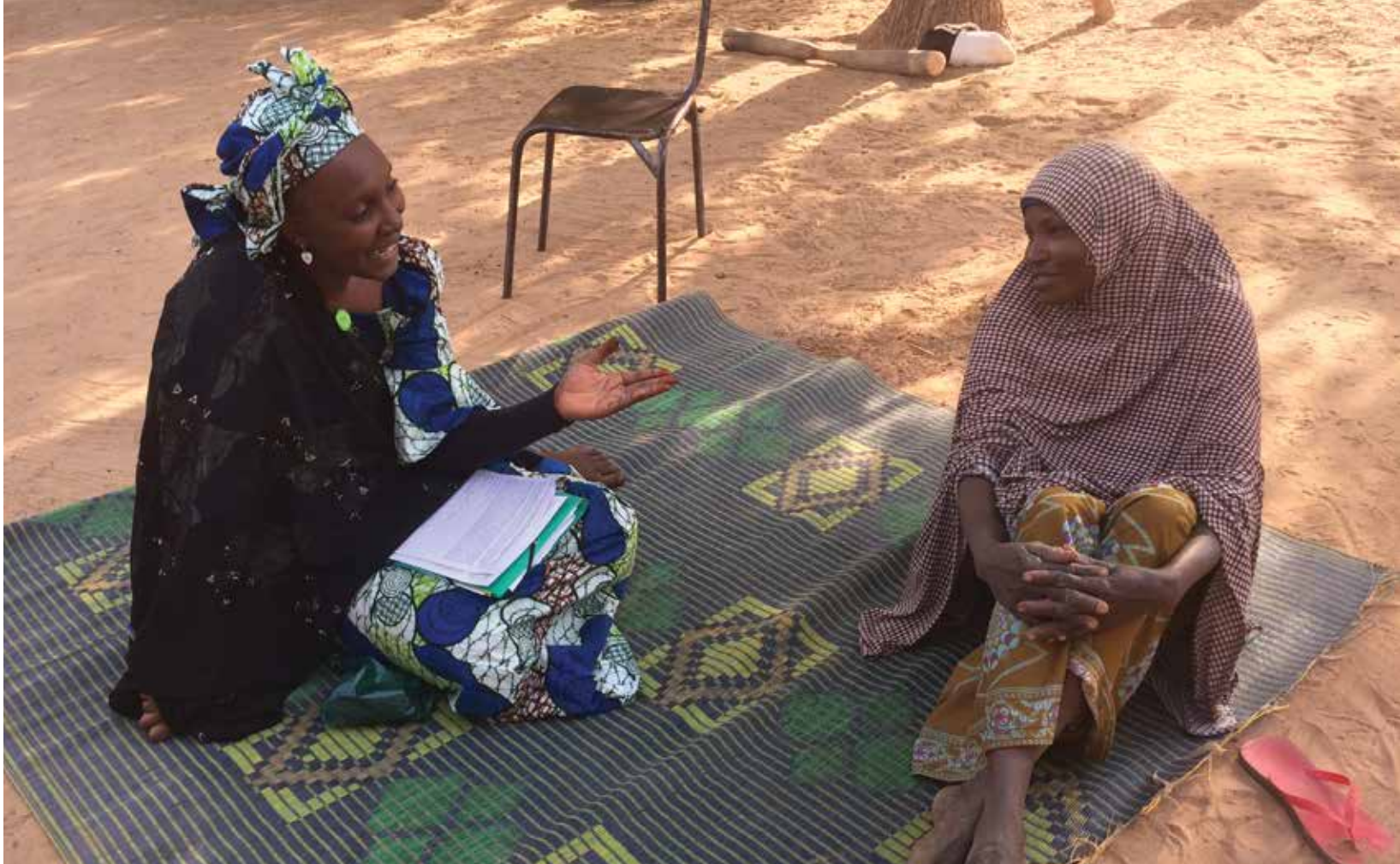
A study team member interviews a mother in Dan Gado.

example—and continue to disseminate new themes to increase their support. More research is needed to understand additional approaches that can be implemented to address these barriers. An approach that is more focused on community-based