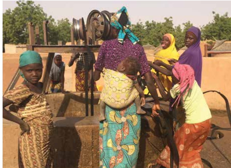
Women fetch water in the village in Dan Gado, where community videos on MIYCN encourage men to share responsibility for household chores and family nutrition.

Other respondents who saw the videos confirmed the importance of everyone seeing these videos, including people such as co-wives, mothers-in-law, and community members. A mother-in-law recommended that the videos be shown to the men instead of having the women relay the information to their husbands, so that the men could see what the women were trying to explain. The videos would catch the attention of the men, just as they had the women. One community member suggested that the videos should be shared with anyone who had not viewed them. He also requested that the video production team increase the number of topics covered by the videos.