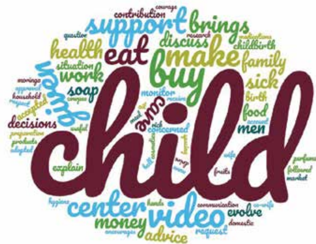
Figure 2. Word Cloud Showing the Most Common Words Coded Under "Support"

"The support I give to my wife has evolved in the sense that I buy her cosmetics (soaps, perfume, oil). Before this project, I did not do it. I also bring her moringa leaves to improve and enrich her diet, and I do all the other domestic chores namely (transporting water, wood chore)."