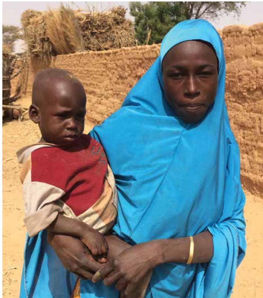
A mother holds her child in Niger’s Maradi region, where study teams conducted in-depth interviews with mothers from five villages.

Objective 3: To assess how community members and important influencers, such as mothers-in-law, perceive changes in spousal communication and husbands’ support for MIYCN behavior after exposure to the SPRING community video approach.