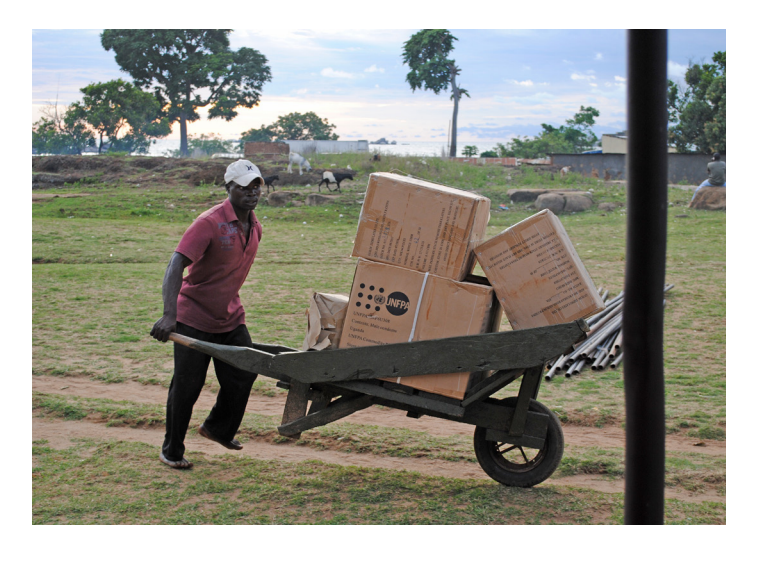
Local fishermen help transport boxes of condoms and other HIVrelated commodities to a health facility on Dolwe Island

STAR-EC has ensured that there is a continuous flow of HIV and AIDS commodities by giving technical assistance to the health facilities in the East Central Region through district focal persons during the bi-monthly ordering cycles of supplies from the National Medical Stores (NMS) and Joint Medical Stores (JMS). While working with the district biostatisticians and health management information system (HMIS) focal persons, health facilities have ordered anti-retrovirals (ARVs) from