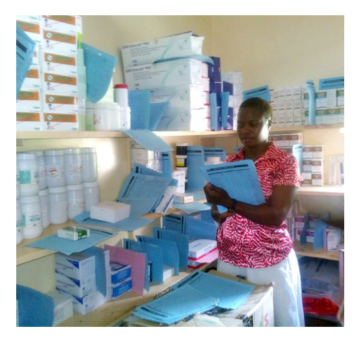
Health facility staff update stock cards during support supervision visits

To ensure increased capacity in supply chain management, through the routine SPARS activities, MMSs were able to visit facilities and conduct continuing medical education (CME) at the facilities to update health workers on the latest supply chain management methods. STAR-EC also worked in collaboration with SURE to ensure that medicines were managed well; LMIS tools such as stock cards were available; and stock books, issue requisition vouchers, and standard operating procedures (SOPs) were provided.