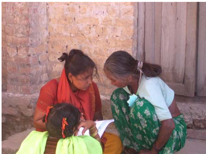
Female Community Health Volunteer (FCHV) counseling a mother-in-law on maternal care.