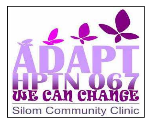
The ADAPT logo—Alternative Dosing to Augment PrEP (Pre-Exposure Prophylaxis) Pill Taking—was developed for the HPTN 067 study that aims to determine a suitable pill regimen for PrEP. More importantly, for Silom Community Clinic's clients, the ADAPT logo represents the ability, courage, and transformation—like a caterpillar into a butterfly—to adopt healthier behaviors.

With a laboratory on-site, SCC uses anonymous rapid HIV testing technology to provide same-day test results after the initial pre-test counseling session, which assesses the risk profile of the client and provides information on HIV and STIs. Clients who test HIV-positive have blood drawn for initial CD4 testing directly after post-test counseling. Clients return in one week for the CD4 result when referrals for services within the public health system, including tuberculosis screening X-ray, are given. Couples counseling and testing is also available upon request. After testing, clients receive 30 minutes of post-test counseling regardless of the test result to help preserve confidentiality and prevent stigma or easy identification of clients who test positive. This process does not affect the responsiveness of services (e.g., counselor availability). Clients attend VCT without an appointment and report efficient service with minimal wait times. The clinic also offers viral load testing to determine the HIV status of individuals who have symptoms of acute HIV infection, which occurs two to four weeks after infection with HIV.