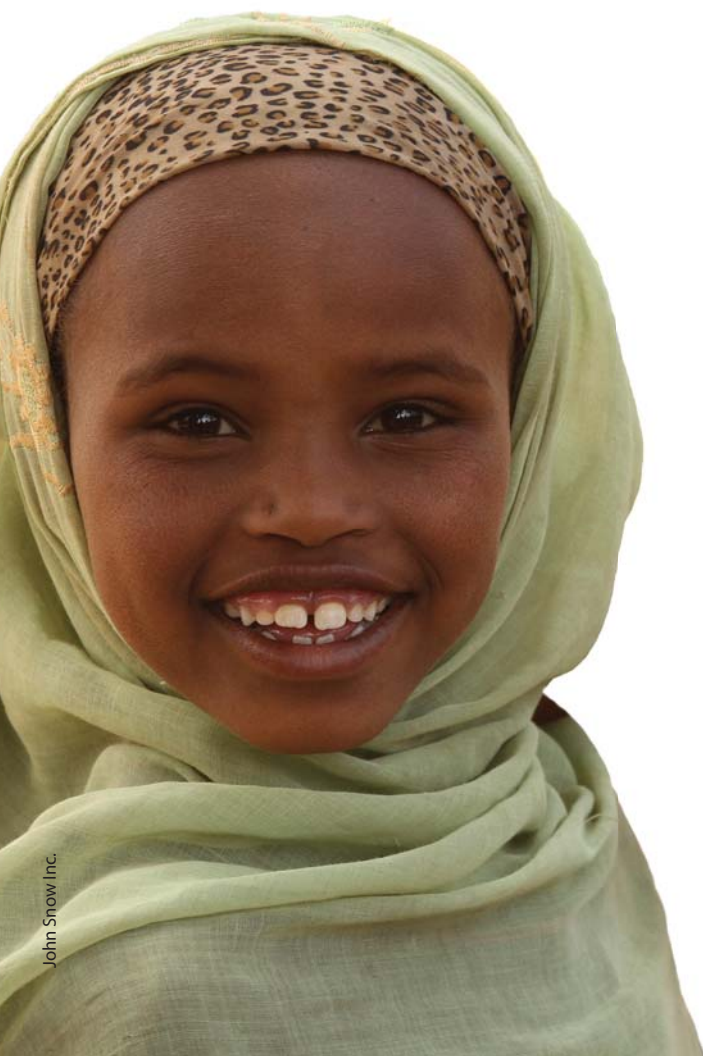
John Snow Inc.

For more than a decade, Ethiopia has undergone a period of deliberate, rapid and intense change—much of it at community level—and made sizable investments to improve the health of its population. This experience presents an excellent opportunity to take stock of promising interventions and innovations, identify why and how they work, and foster critical thinking and new learning to improve immunization and family health services.