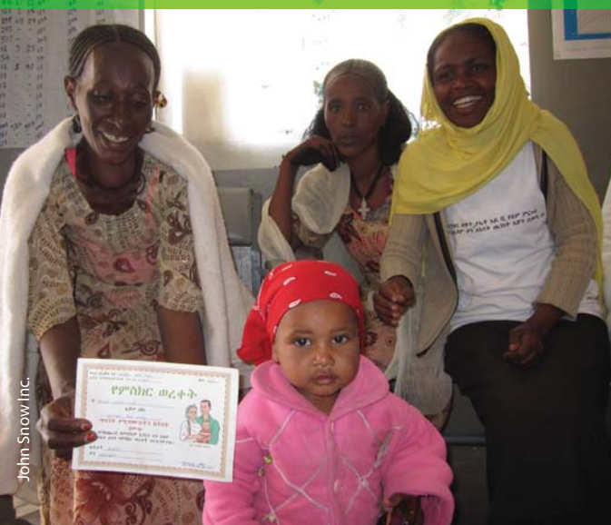
John Snow Inc.