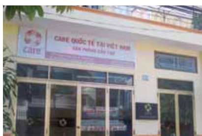
CARE's STEP Office in Can Tho, Vietnam