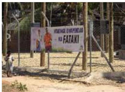
A child walks by a Fataki banner in Kilwa, Tanzania.