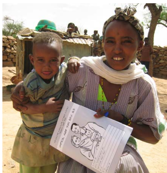
A volunteer in Werie Leke woreda in Tigray Region prepares to visit her neighbors with the family health card in hand.

Community responses to vCHW activities have often been characterized by initial resistance to health messages or recommended practices followed by gradual acceptance. The rate at which improved health practices were adopted varied among different households and depending on the types of practices that were recommended. Latrine construction faced the most resistance partly because of the material and labor inputs that it requires. Community resistance was sometimes manifested in accusations that vCHWs were engaged in what they were doing for their