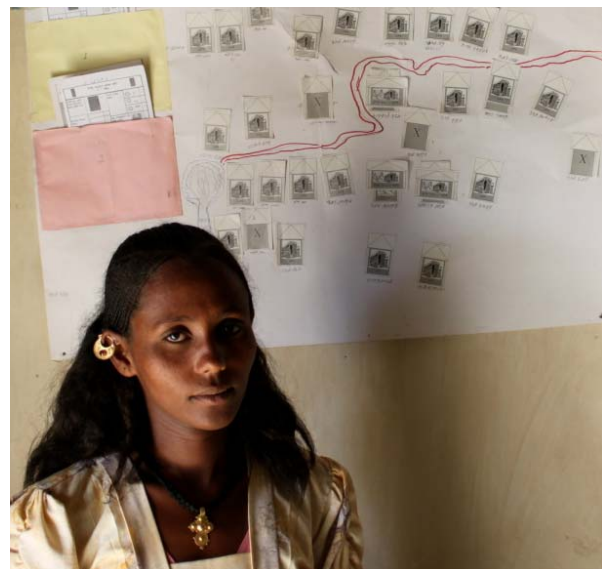
Volunteer Community Health Workers are taught to map their community and track pregnancies and children in the households they visit.

CHW training takes place soon after their selection. Most of the vCHWs who were interviewed in this study were trained by HEWs in their got or kebele. Those in Tigray and SNNPR also received training from Woreda Health Bureau (WHB) staff at the woreda center as well as by an NGO in the latter region. The trainings at the kebele level mostly lasted from 3 to 4 days, either consecutively or over several weeks. In Kurar kebele in Amhara, it was only the vCHWs that were recruited four years ago who had received a three day training, whereas newly recruited ones had only received a one-day orientation. In Tigray and SNNPR, vCHWs had been trained for three to