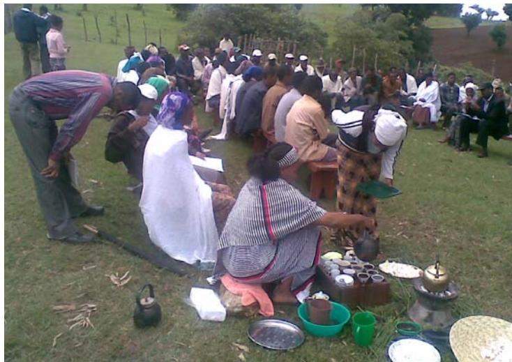
Community festivals engage and honor voluntary community Health Workers, increasing their visibility in the community as well as their motivation to continue volunteering.

There was general agreement that reviews or evaluations of their performance served as a good incentive for vCHWs. It appears to be a common practice for HEWs to review the performance of vCHWs on such indicators as numbers of children vaccinated, women attending ANC and latrines constructed. Respondents claimed that such reviews were motivating because they allowed recognition of their achievements or superior performance, created a sense of competition and helped identify shortcomings. Some of them also believed that future reviews by HEWs and the community would allow them to assess how vCHWs were performing relative to plans and community expectations and would therefore strengthen vCHWs' motivation and initiative.