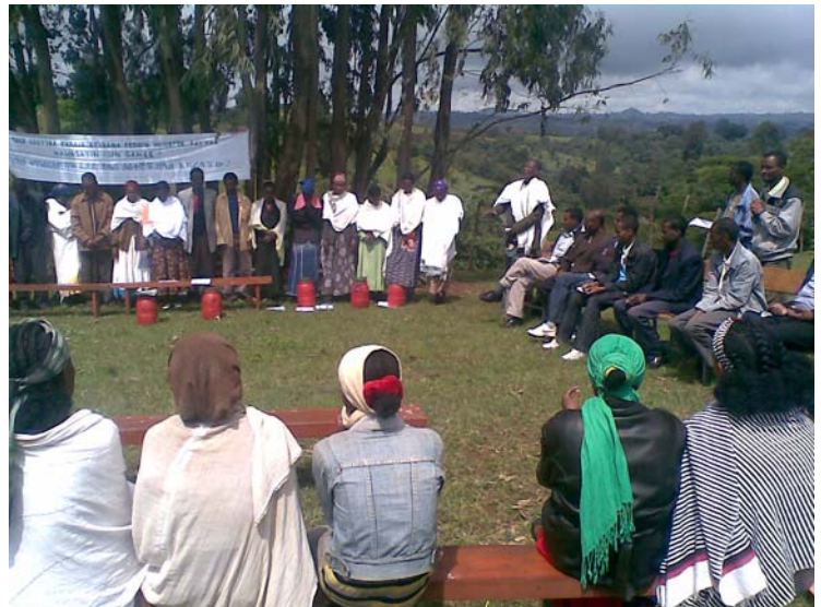
When elders bless vCHWs during community festivals, it increases their pride and strengthens their commitment to the work.

Increased community recognition was therefore likely to enhance community acceptance of their work and further motivate them, according to some vCHWs. They agreed that an event organized to recognize their work or thank them in front of their community – a form of NFI proposed by the L10K project – would strengthen their motivation. The 23 year old mother of two in Gola kebele of Dilla Zuria woreda in SNNPR described its potential impact by saying 'If we are recognized and thanked in front of the community, it would motivate us to work even more.' Another woman in Hatsebo kebele from Laelay Maichew woreda in Tigray also said: