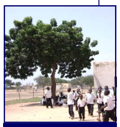
Abyei Boy's School, Abyei Town.

Support PTAs and health facilities with small grants for community development projects, such as latrine building and improvement of clean water supplies.